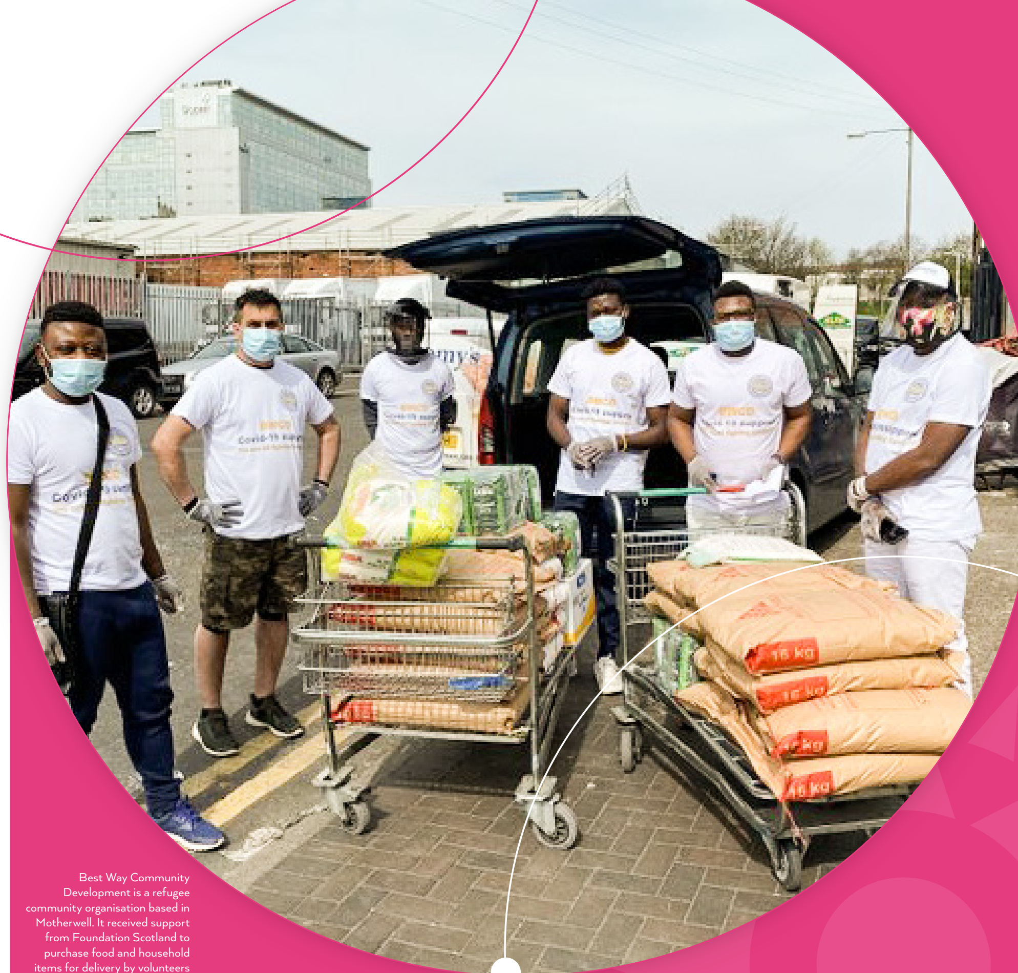
Best Way Community Development is a refugee community organisation based in Motherwell. It received support from Foundation Scotland to purchase food and household items for delivery by volunteers to vulnerable and isolated refugee and BAME individuals and families.

Danny Kruger MP in Levelling up our communities: proposals for a new social covenant (September 2020)