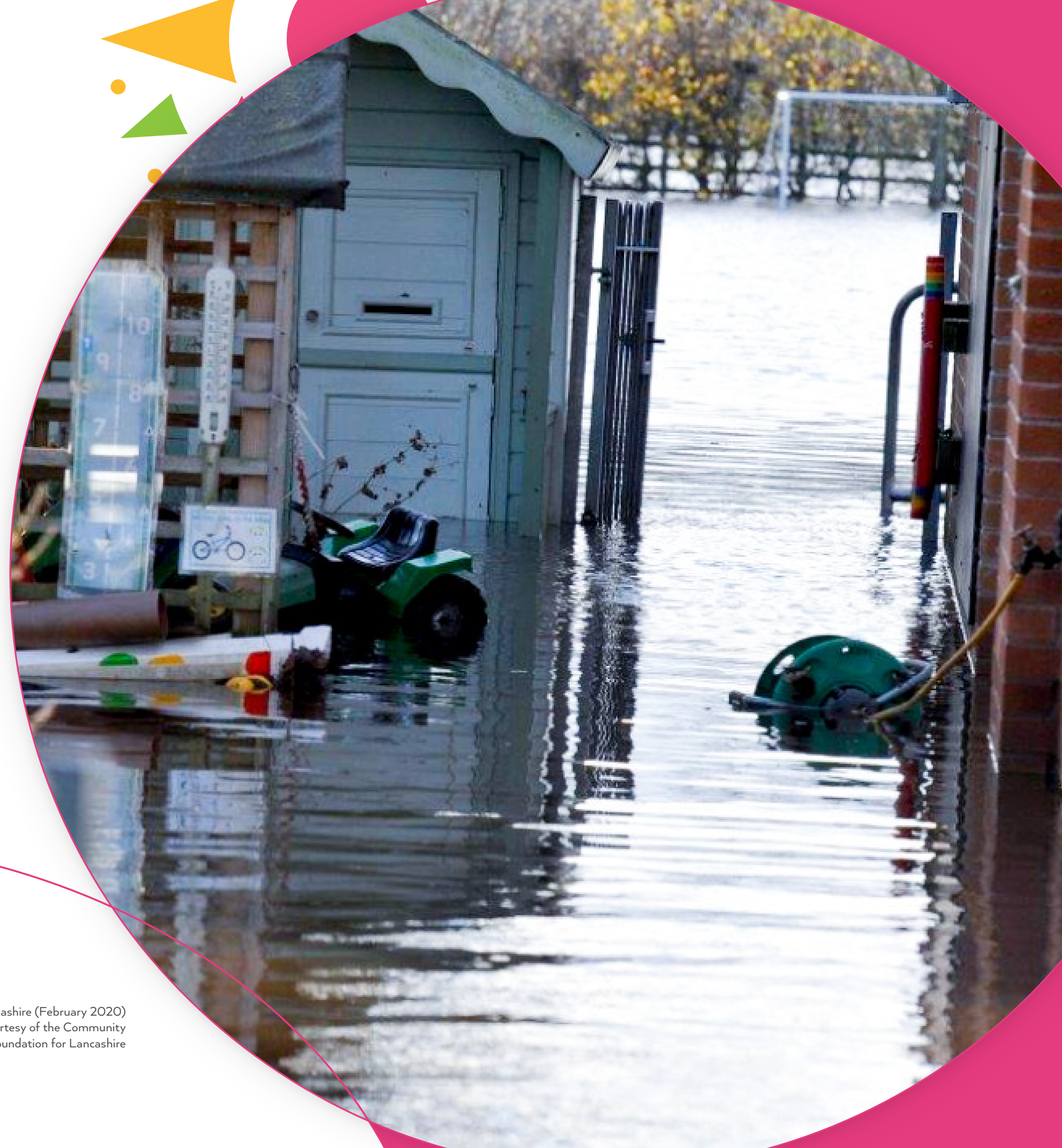
Flooding in Lancashire (February 2020)

Whilst no one was fully prepared for the challenges presented by the coronavirus pandemic, community foundations and the National Emergencies Trust were in the best position to ensure that money raised at a national and local level was able to quickly reach the organisations best placed to make the biggest difference.