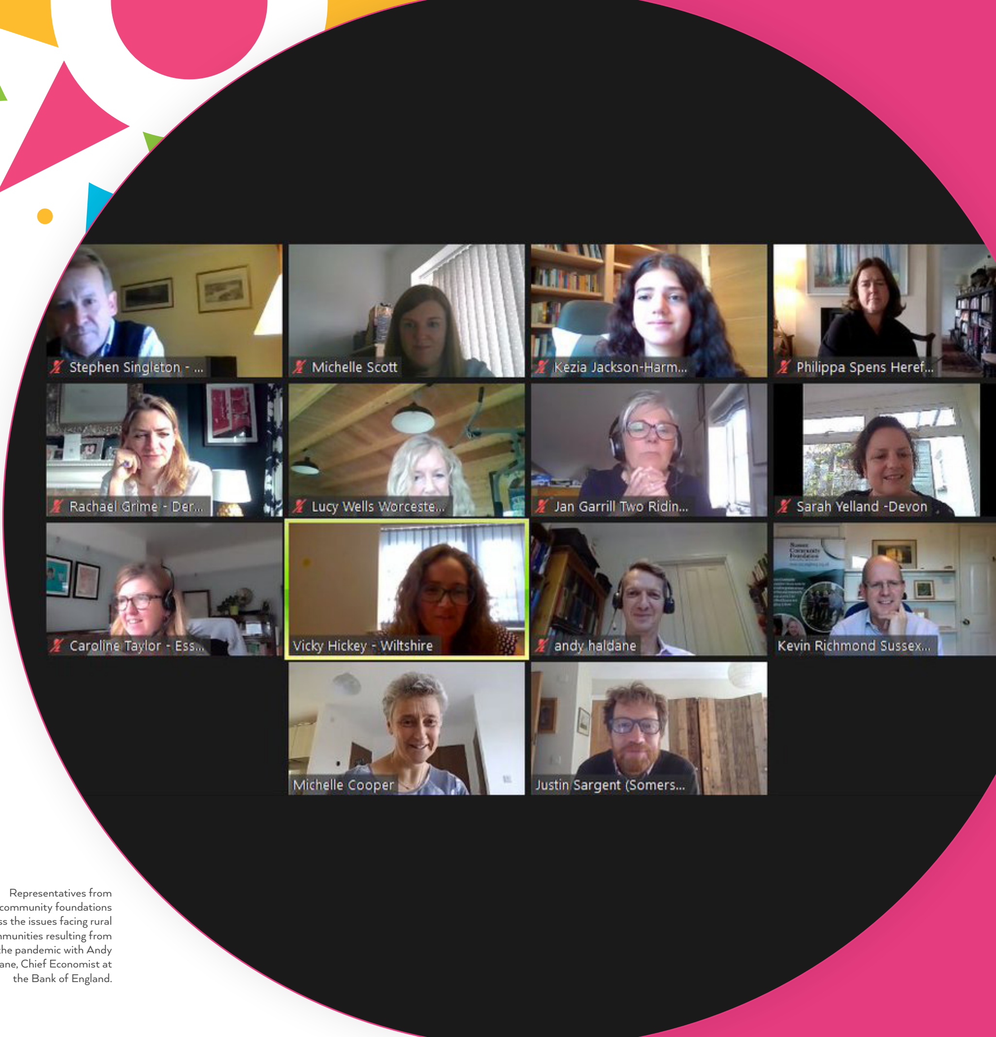
Representatives from community foundations discuss the issues facing rural communities resulting from the pandemic with Andy Haldane, Chief Economist at the Bank of England.

In lieu of any reliable quantitative national data on the effects of the pandemic these forums provided invaluable opportunities to share qualitative information that could paint a reliable picture of local need. Rather than just focusing on the immediate problems presented by the pandemic these convenings also provided the opportunity to begin addressing some of the long-term challenges facing communities and the wider voluntary sector.